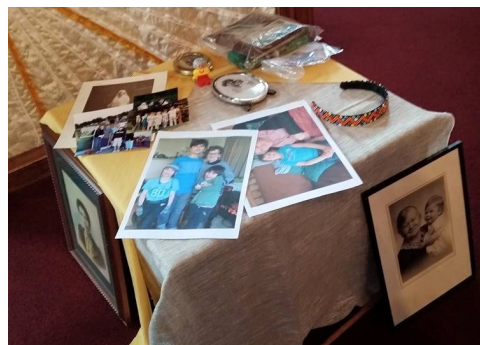
Photos & mementos of our grandmothers were brought up during the service