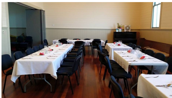
Getting ready for the dinner